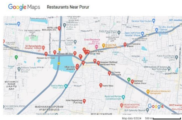
Fig. 1. Restaurants around porur

densely populated residential area, boasting a plethora of thriving restaurants in its vicinity. Figure 1 is a representation of the Google map showcasing the restaurants in Porur. The ability to provide online food delivery services is imperative for the sustenance of most restaurants. However, the primary challenge faced in the realm of online business pertains to logistics. It is essential to analyze delivery zones to accurately determine delivery distances thoroughly. Ensuring timely delivery and maintaining food quality standards are pivotal for the success of restaurants. Business proprietors often grapple with issues related to vehicle allocation and delivery services. Timely delivery emerges as a pivotal factor influencing customer retention rates. Hence, establishing a successful food delivery business necessitates implementing an effective strategy in vehicle allocation. In our study, the choice of delivery vehicle remains flexible, tailored to specific criteria such as distance, congestion, and order size. While bikes excel in dense urban areas for short distances, scooters and motorcycles offer greater speed and coverage. Cars are preferred for longer distances or larger orders, often utilized by major delivery services like Uber Eats. Vans are utilized for bulk deliveries or when transporting substantial quantities of food. Thus, the selection of vehicle is contingent upon various factors to ensure efficient and effective food delivery.