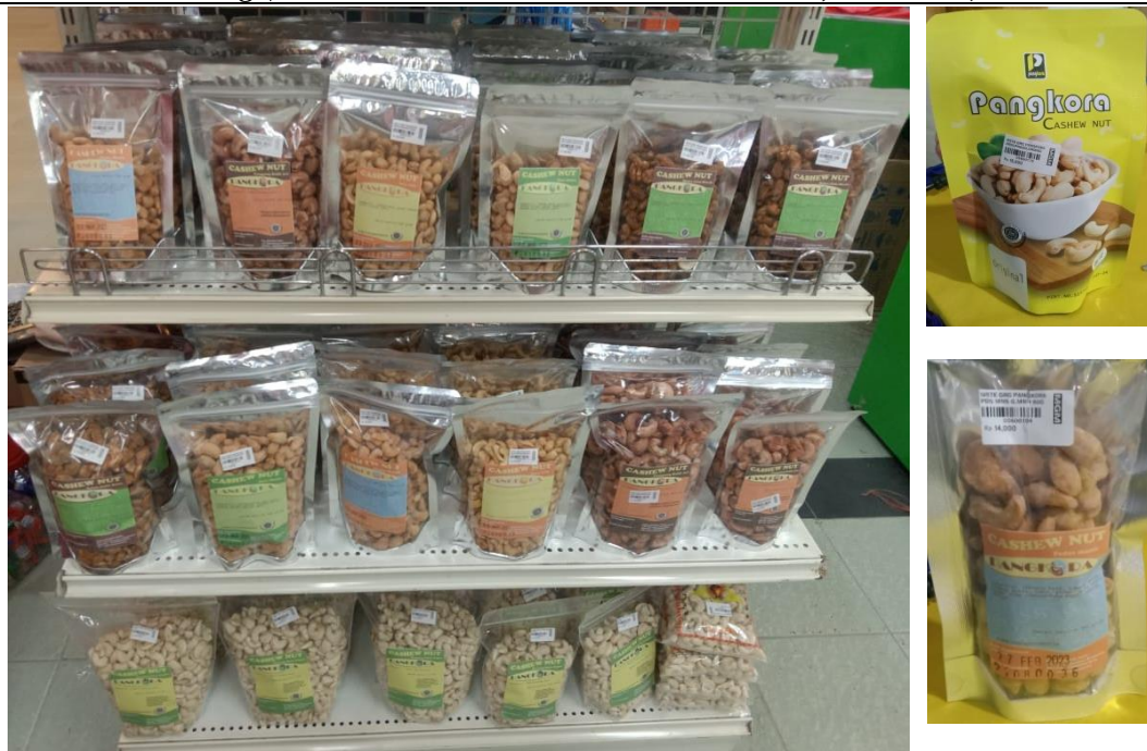
Fig. 1. Products by MSME CV hukasari semesta in muna