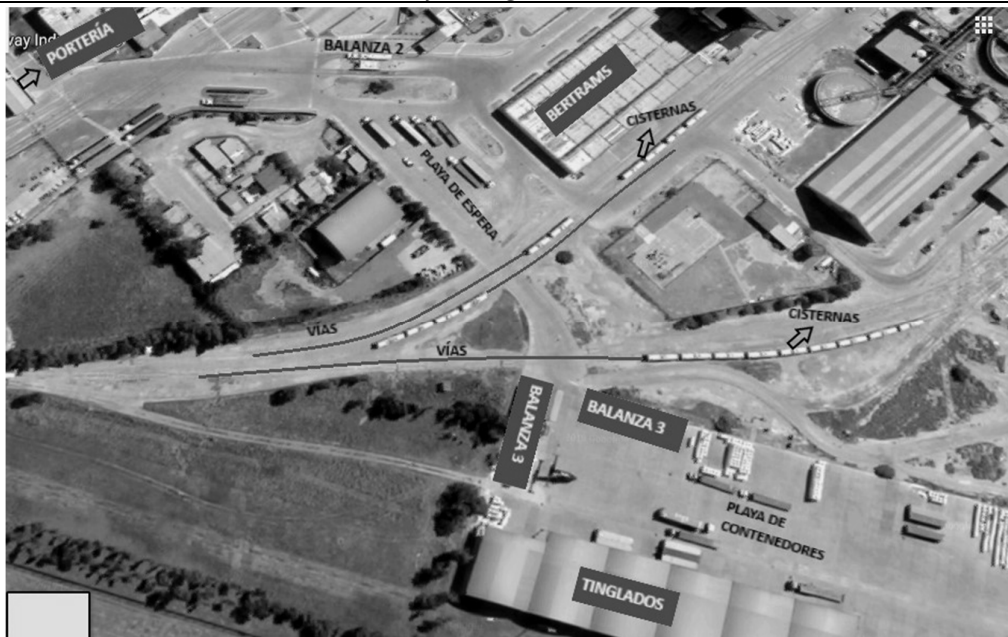
Fig. 5 . Alternative 3: the new Balance 3 at entrance of container beach.

In turn, the light that must be left on the tracks must be enough so that the tanks that carry hazardous chemicals circulate, and thus, avoid any type of accident. In addition, by placing balance 3 in this position, it will practically limit its use exclusively for container trucks (for export) and trucks that load product available only in the sheds from 1 to 6. For trucks that load in silos (sector where it is loaded in bulk), production shed, sheds from 7 to 15 and transfer area would not be viable since the route of the trucks increases excessively. All this increases