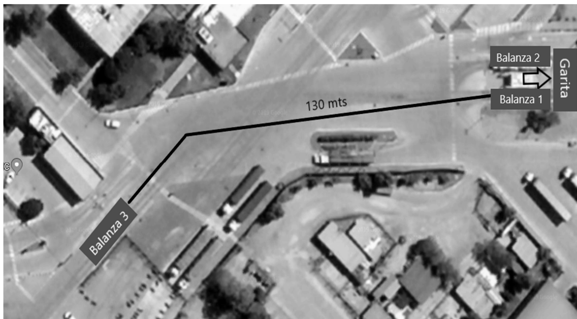
Fig. 2. Balance 3 located at the entrance checkpoint

would not be affected. The balance 3 can only weigh trucks entering the premises, whether full or empty. An important aspect to analyze is the distance between the goal and the balancing office: 130 meters, which the driver must walk walking to show the relevant documentation. This long journey implies considerable time, which would have an impact on the operation not only the operation of the new balance but also the other two, by inhibiting the entry of new trucks.