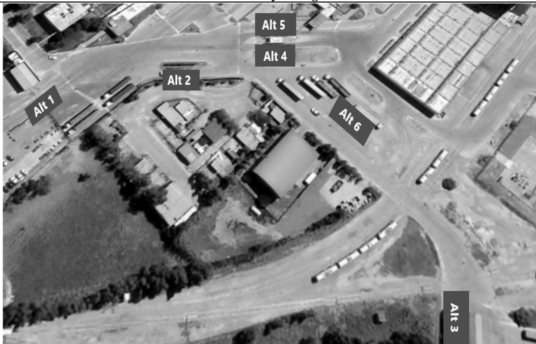
Fig. 1. All possible locations of Balance 3--