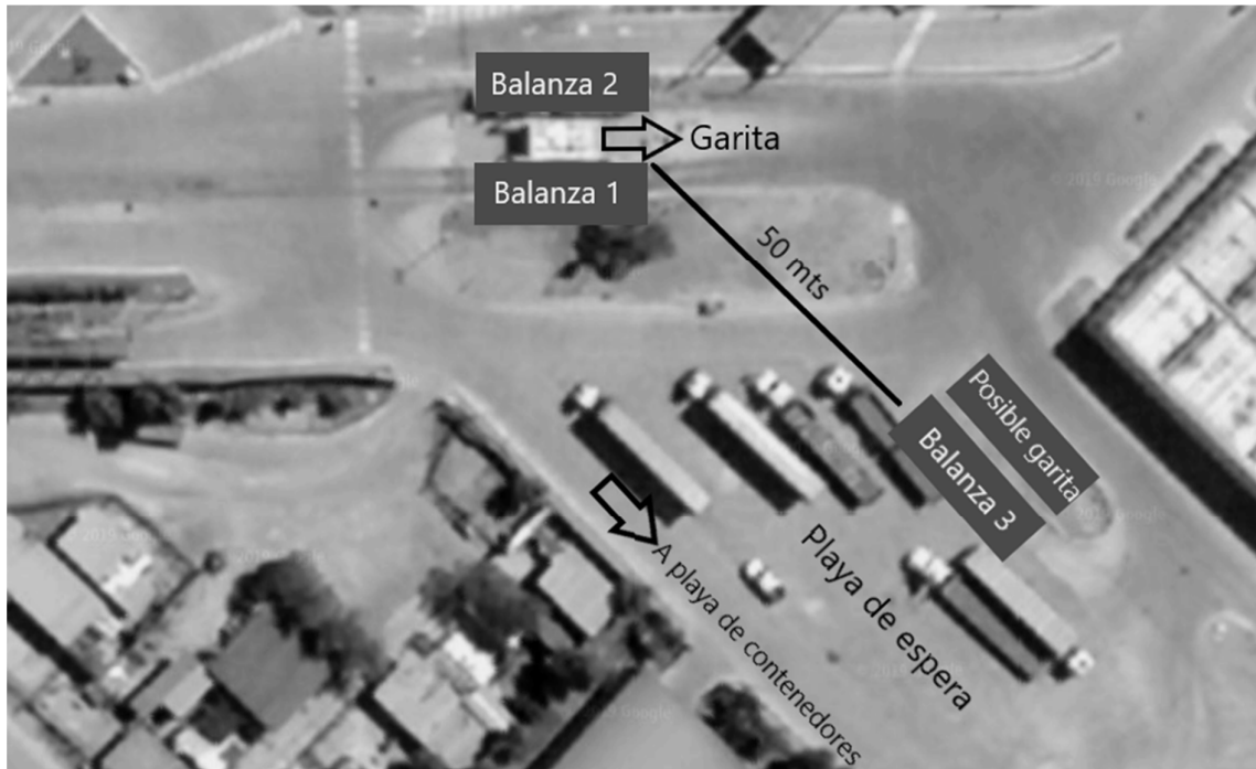
Fig. 8. Alternative 6: the new Balance 3 located in container area.

transit plan. A subsequent drawback is that the only available sector suitable for a new truck waiting parking is the container area. What would generate a complete restructuring of the internal logistics system by having to reposition the container area.