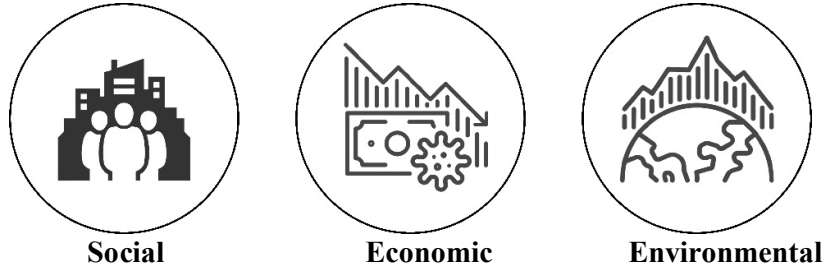
Fig. 2. Sustainable dimensions

A generic sustainability dimensions are depicted in Figure 2.