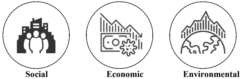
Fig. 2. Sustainable dimensions

A generic sustainability dimensions are depicted in Figure 2.